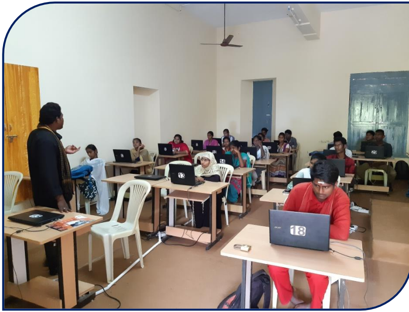
Students in Skill Development Centre in Student Orientation Programme (SOP) V.S.R & N.V.R College, Tenali