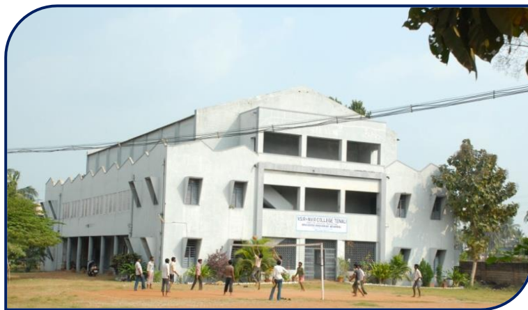
Students in Play Ground in Student Orientation Programme (SOP) V.S.R & N.V.R College, Tenali