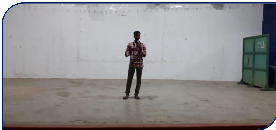
Senior Students interaction with First Year Students in Student Induction Programme (SOP) V.S.R & N.V.R College, Tenali