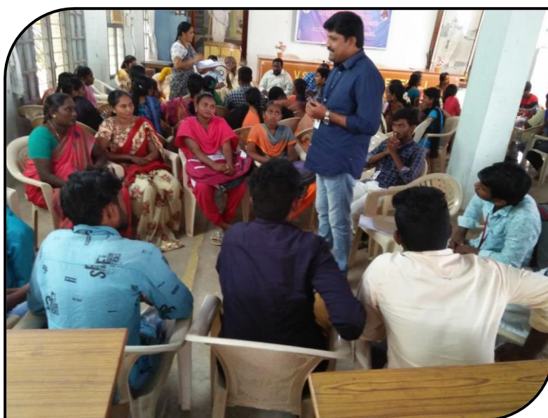
Parents of 1 st Year Degree students with Mentors in Student Orientation Programme (SOP) V.S.R & N.V.R College, Tenali