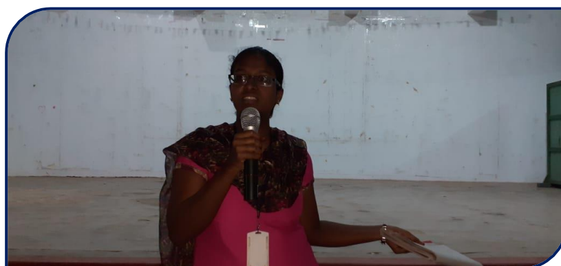
Response of Students in Student Orientation Programme (SOP) V.S.R & N.V.R College, Tenali