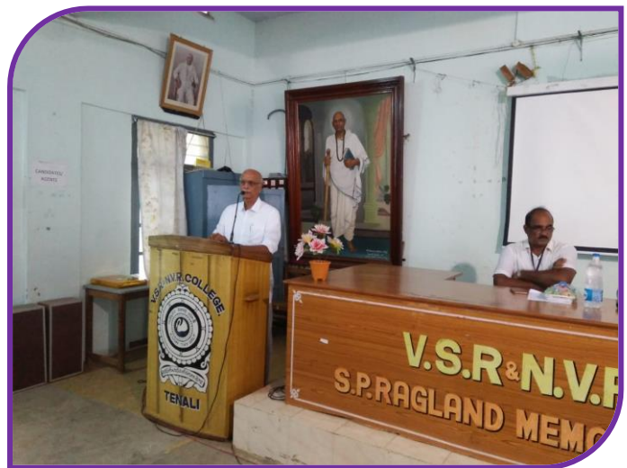
Students and Staff Participated in the STUDENT ORIENTATION PROGRAMME VSR & NVR College, Tenali.