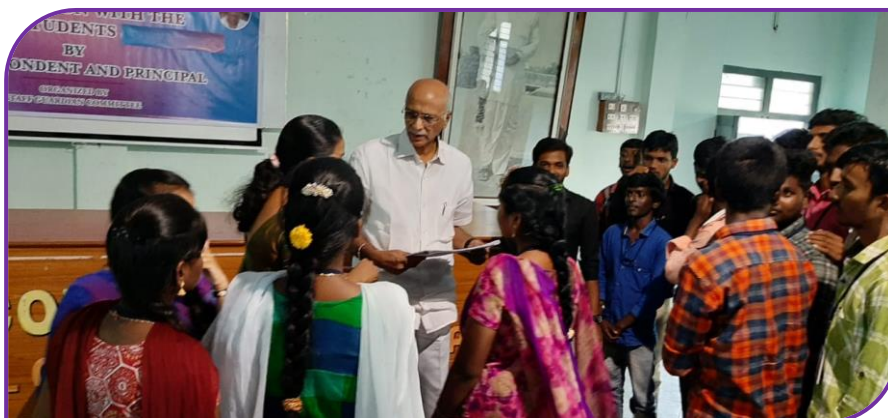
Correspondent interacts with the First year students and their Parents V.S.R & N.V.R College, Tenali