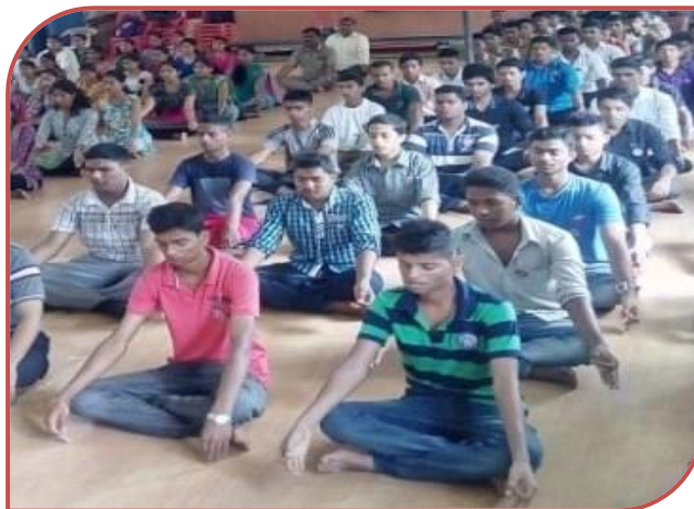
First year students in PYRAMID CENTRE, YOGA Student Orientation Programme (SOP) V.S.R & N.V.R College, Tenali