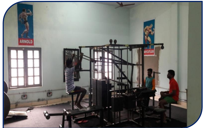
Students in Multipurpose GIM in Student Orientation Programme (SOP) V.S.R & N.V.R College, Tenali